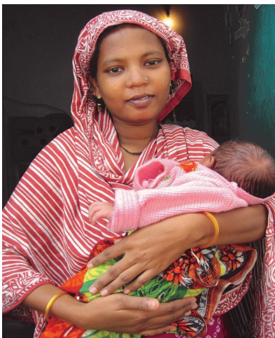
Mother and newborn in Bangladesh.

Countries in sub-Saharan Africa have also begun to move forward with chlorhexidine for umbilical cord care. Recently, chlorhexidine was introduced for cord care in the Nigerian state of Sokoto through community-based distribution. As a result of this successful effort, the Nigerian Ministry of Health has made 7.1% chlorhexidine digluconate a priority commodity for newborn health and has committed to scaling it nationally. Efforts to establish local production capacity in the country are also underway. Both Liberia and Madagascar have completed formative research and are now beginning pilot introduction programs of 7.1% chlorhexidine digluconate for umbilical cord care. Further, the adoption of chlorhexidine for umbilical cord care is under earnest consideration by the ministries of health in several other countries in sub-Saharan Africa and South Asia.