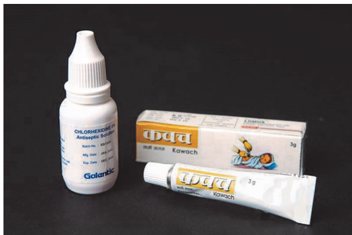
Products examples.