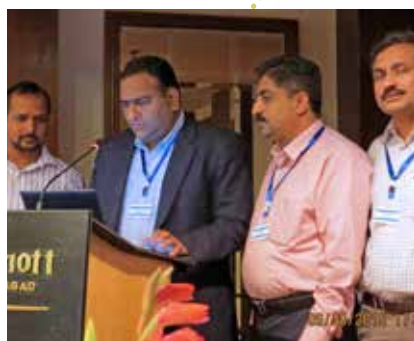
Pakistan: Group presentation of a case study