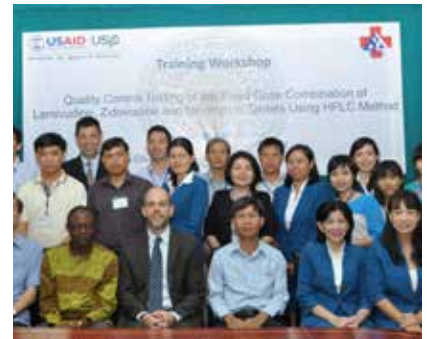
Vietnam: Group photo of the training workshop