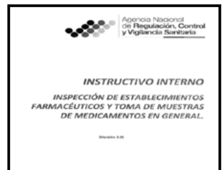
AMI: Cover page of the guidelines in Ecuador that includes the Three-Level Approach