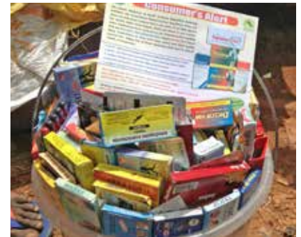
Liberia: A consumer alert informs the public of falsified medicines