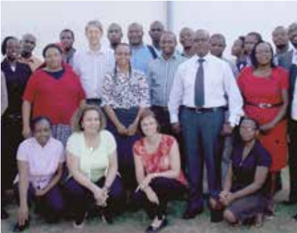
SANAS group shot

Drugs Authority (FDA). The Ghana FDA, with support from PQM, established a functional MQM program throughout the country and strengthened the capacity of the FDA's NQCL. During FY15, PQM helped the Ghana FDA physico-chemical lab take corrective actions after an American National Standards Institute-American Society for Quality (ANSI-ASQ) National Accreditation Board (ANAB) audit detected minor shortcomings. As a result, the FDA lab maintained its accreditation status.