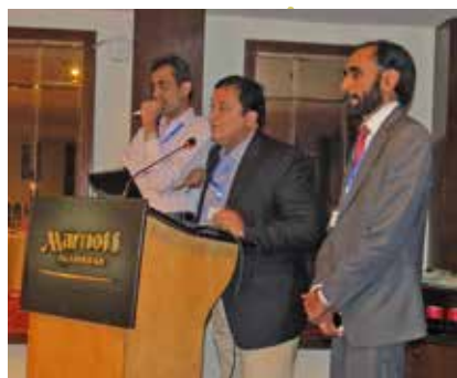
Pakistan: Group presentation of a case study