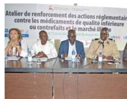
2015 inter-ministerial committee (IMC) workshop

improvement upon 2010–2012, when a survey by NAFDAC revealed a failure rate of 19.6%. Senegal launched the MQM program in five sentinel sites in 2002 to monitor antimalarials. In 2009, the program expanded to four additional sites and began covering antiretrovirals, antituberculars, and contraceptive products. Senegal's National Laboratory for Medicine Quality Control (LNCM), with support from PQM, has been working to obtain ISO 17025 accreditation. As a result, the lab is better equipped to comply with international quality management system (QMS) standards. PQM facilitated the transition of MQM from academia to the DPM, as well as the integration of NQCL and the National Health Programs (NHP). Although it has limited funding from PQM, MQM is fully integrated and supported by annual contributions from NHP, DPM, and the NQCL.