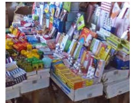
Liberia: Confiscated medicines, including antimalarials