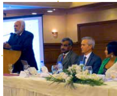
Pakistan: The closing ceremony of the week-long training with featured honorable guests