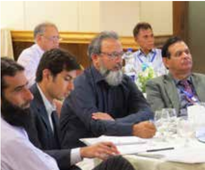
Pakistan: Participants learn among QC lab training participants about good practices for pharmaceutical quality control at a training workshop.