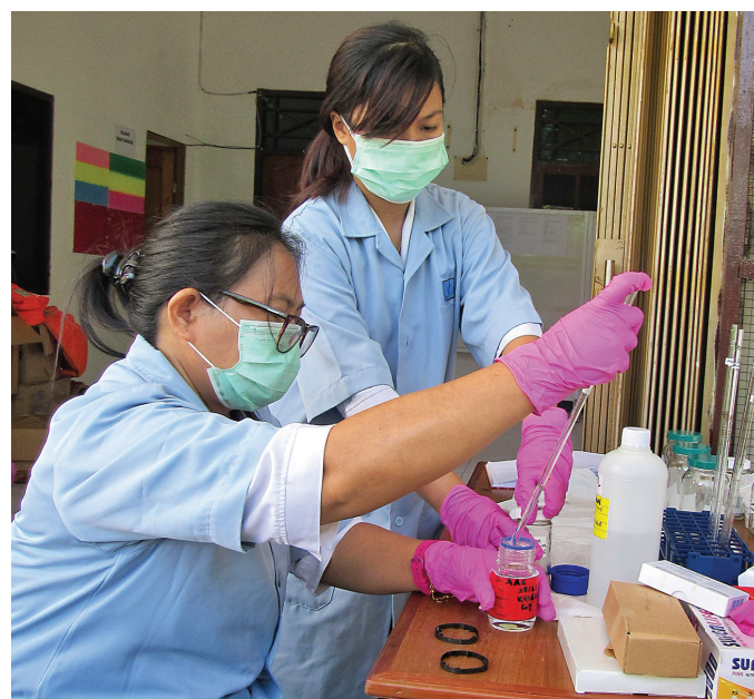
PQM training on analytical techniques used in testing medicines collected during BPOM's post-marketing surveillance.

The stage was set with an unprecedented policy shift, but Indonesia's medicines quality testing laboratories were still lacking the necessary equipment and materials to handle samples coming in from both the private and public sectors.