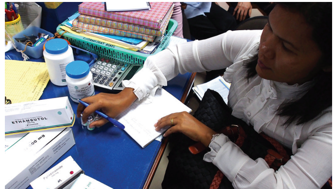
Government BPOM inspectors sampling TB medicines for testing at the provincial quality control laboratory.

A highly functioning quality assurance system supports the identification of problems in the supply chain and amelioration of any issues related to the distribution or use of substandard or falsified medicines that could harm patients. This is especially crucial in an era in which many antibiotics and other antimicrobials are developing resistance to many common medicines. In Indonesia, with the second highest prevalence rate of TB in the world, concern for drug resistance is not merely theoretical. Efforts are underway to address the numerous challenges in medicines production, supply chain, and use to ensure that medicines available in the government and private markets are quality assured and retain their quality at all stages in the distribution chain. As Indonesia continues to develop its risk-based post-marketing surveillance system—fortifying analysts with better skills, equipping the provincial