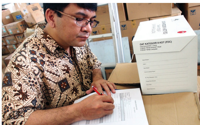
Sampling medicines from government facilities following PMK 75/2016 implementation pilot activity.

implementation of the PMK regulation and to test drive some of the technical guidelines on sampling from government facilities. This was the first time that BPOM inspectors joined forces with provincial and district health offices in collaborative sampling and testing efforts specifically to assess the quality of government-held medicines. This exercise will be replicated and expanded annually with the aim of incorporating these activities into the long-term routine post-marketing surveillance as part of the government’s official sampling strategy. PQM will assess the activity and outcomes to identify future training and technical assistance needs. During the joint sampling exercises, MOH–BPOM field teams made note of improvements needed for the proper physical storage of medicines.