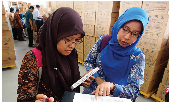
Routine medicines surveillance activities are carried out in Jakarta, Java.

During the development of the PMK 75/2016 regulation, PQM worked with BPOM to outline detailed instructions and guidance for implementation of the regulation. PQM initiated, drafted, and facilitated finalization of the technical guidelines to ensure that sampling and testing algorithms, roles and