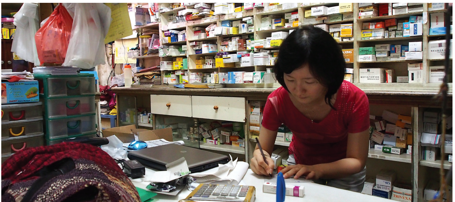
A pharmacist in Medan, North Sumatra collects medicine samples as part of BPOM’s national risk-based post-marketing surveillance system.

Further hampering BPOM’s capacity to monitor the quality of medicines were weaknesses at the national control laboratories where medicines are sent for testing. The quality control laboratory system, consisting of 36 institutions nationwide, was limited in terms of both the types of tests that could be performed and in technical competence on advanced analytical quality control testing according to internationally recognized standards.